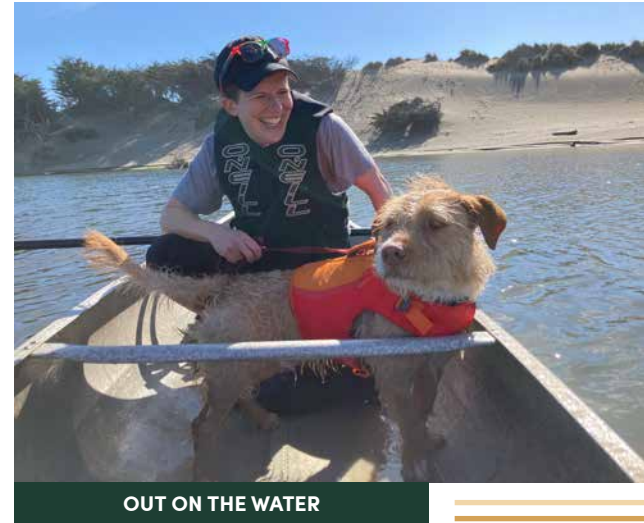
OUT ON THE WATER

They do not shy away from solidarity with all types of people and situations. Their boldness (right down to their pronouns) is a sign of thoughtful protest and hope for a better world. They will teach our child to embrace their uniqueness proudly and to always fight for what they believe in.