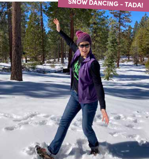
SNOW DANCING - TADA!