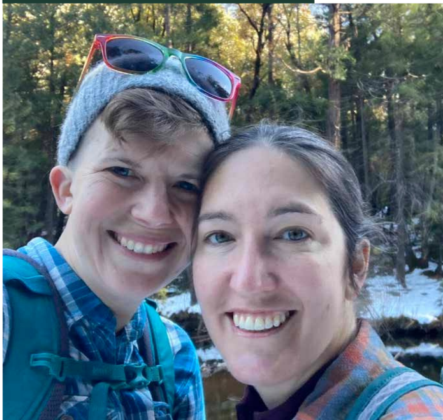
ENJOYING HIKES TOGETHER SINCE DAY ONE

We think we're pretty down-to-earth and easy to talk to. We would love the chance to get to know you.