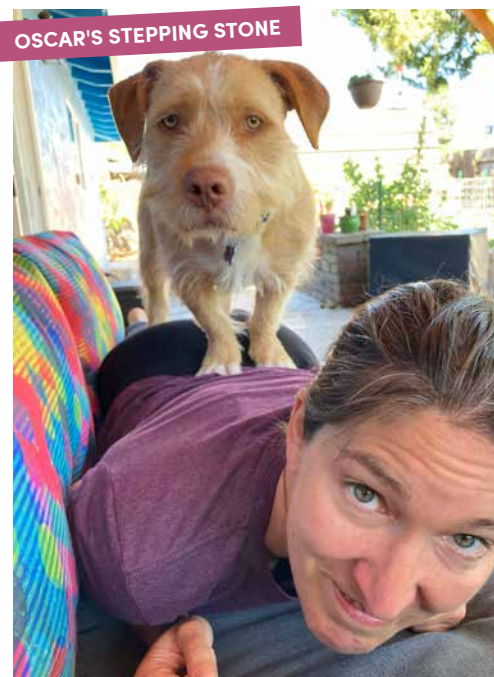
OSCAR'S STEPPING STONE