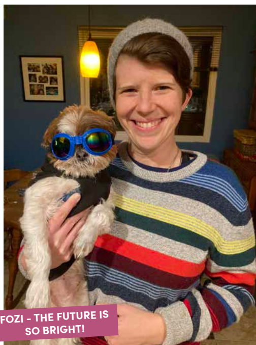
FOZI - THE FUTURE IS SO BRIGHT!

Fozi is a senior citizen shih tzu, and mostly just naps on the couch. Oscar is a three-year-old terrier mix who is often found chasing a toy in our fenced-in backyard (and down our hallway). He's a clever dog who likes to play hide-and-seek. He loves kids, and peanut butter!