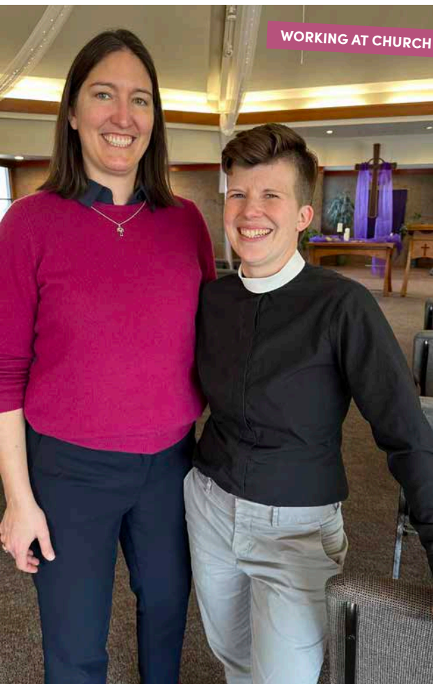
WORKING AT CHURCH