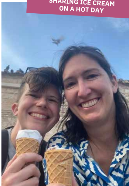
SHARING ICE CREAM ON A HOT DAY